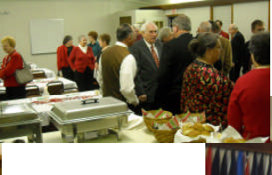
Thank You BRBA WMU